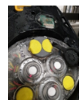
Figure 3 - Experimental CO2 sensor

More recently a form of CO<sub>2</sub> sensor has been used for diving with rebreathers. It is known as a non-dispersive infra-red (NDIR) sensor. Put simply, using infra-red light it measures the spectral response of CO2 when the light is passed over it. Unfortunately, the spectral response of water is similar to CO<sub>2</sub> and can also be detected. This can create a 'false positive' (high reading) and a shorter dive endurance, which in itself can be seen as a 'fail safe' scenario. Some manufactures have successfully integrated NDIR sensors in rebreathers with additional moisture filtration, sometimes at the expense of sensor response time and long duration use (due to filter degradation) is still potentially an issue. Gas density can also affect these sensors but can in most cases be compensated for.